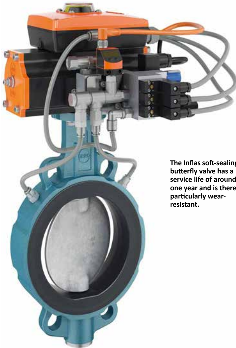
The Inflas soft-sealing butterfly valve has a service life of around one year and is therefore particularly wear-resistant.