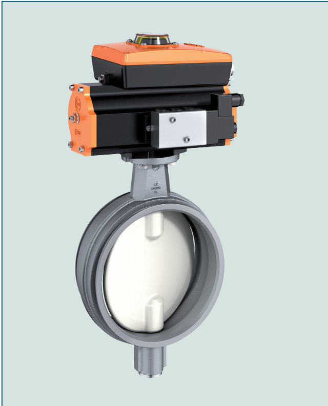
Butterfly valve CK with pneumatic actuator.